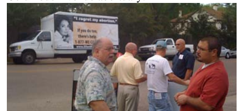
“Carolyn” at the abortuary. In the billboard message actress Jennifer O’Neill proclaims “I regret my abortion.”

“Carolyn” is driven out to send powerful pro-life message at each monthly Second Sunday gathering, to each monthly Life Chain, and each Thursday morning when Planned Parenthood inflicts surgical abortions at its 1927 Columbus Avenue abortuary.